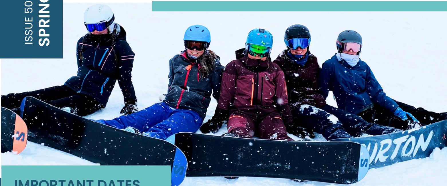
A group of Revelstoke students snowboarding at SilverStar Mountain in February.